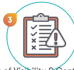
3 Loss of Visibility & Control to achieve Data Sovereignty Compliance

We very much need a secure digital space for file exchanges and collaborations to mitigate file security risks driven by expanding attack surfaces and increasingly advanced cyber threats.