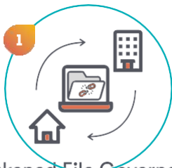
1 Weakened File Governance due to Hybrid Working & Shadow IT

The constantly evolving digital workplace has created new challenges that are often overlooked until breaches happen. data